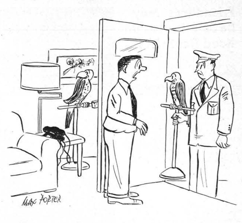
"SOMEONE IN THIS HOUSE ORDERED A FEMALE PARROT?

Last May 200 of their chickens caught cold. The girls gave each of them a drop of rum and rubbed their chests. Every chicken lived and grew into fine drumsticks.